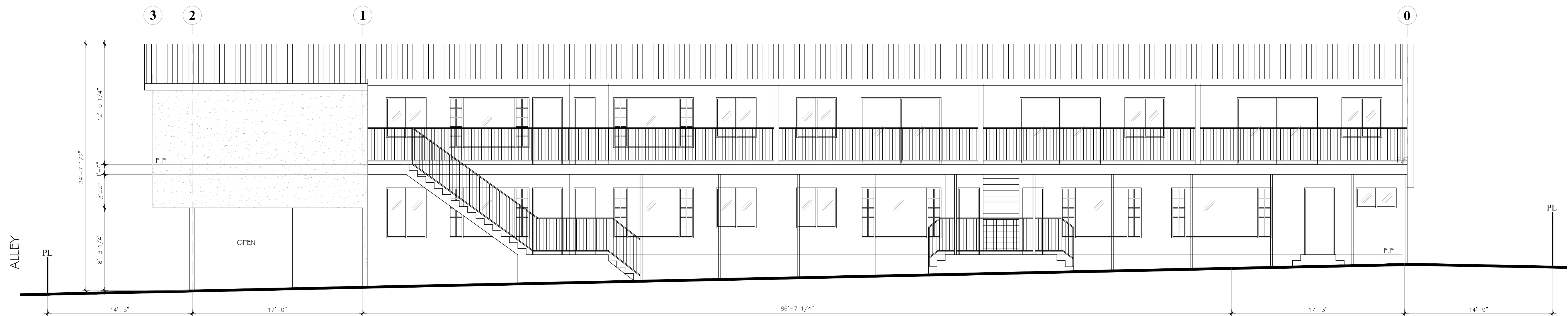
NORTH ELEVATION-SOFT STORY RETROFIT