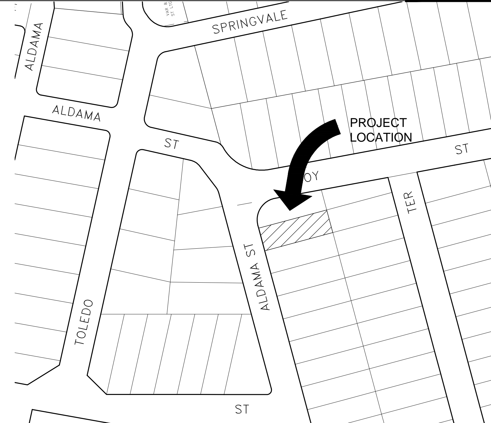
VICINITY MAP SCALE: 1"=100'